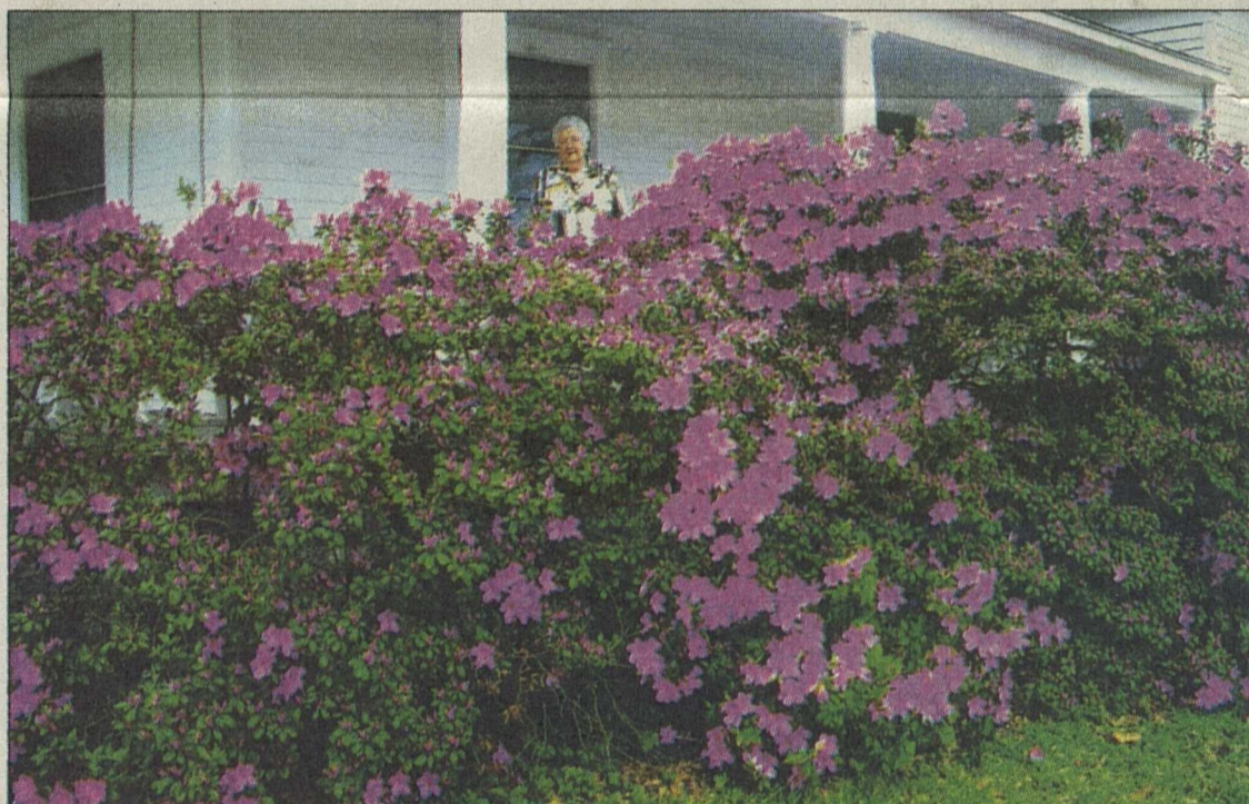
The Kohleffel home located at 500 W. Post Office is The Garden Club's April Yard of The Month.